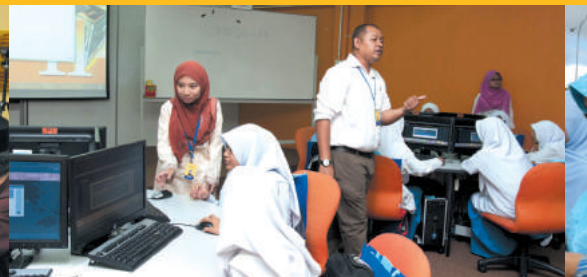
Tell me more