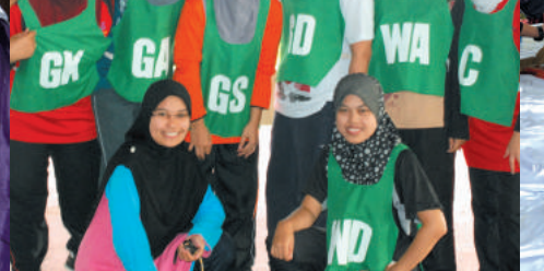
We got game