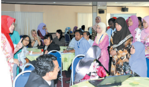
Receptive and attentive