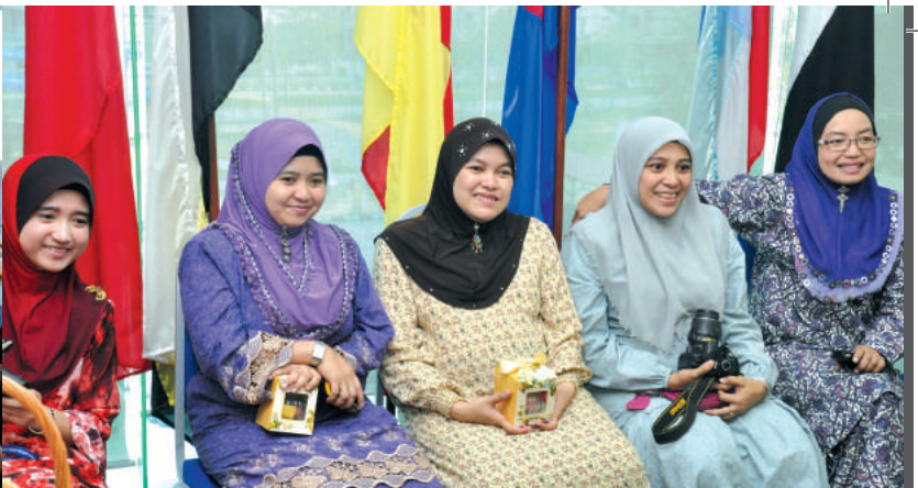
Always be around