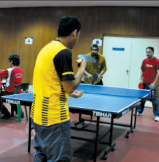
Like a pro