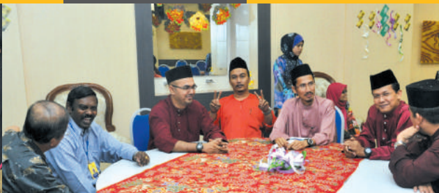
Stay close together