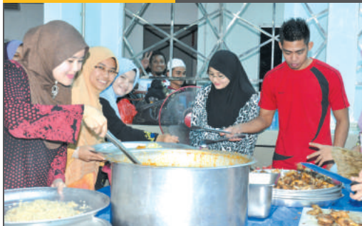
Good deed for the day