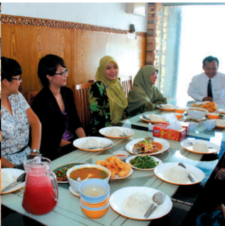
A special treat