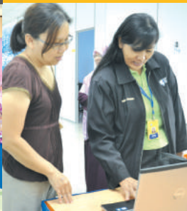
What's your ID?