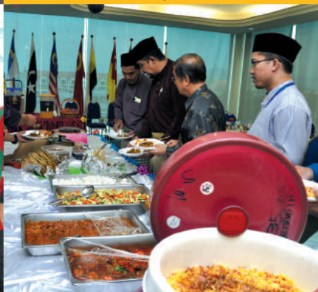
Too enticing to refuse