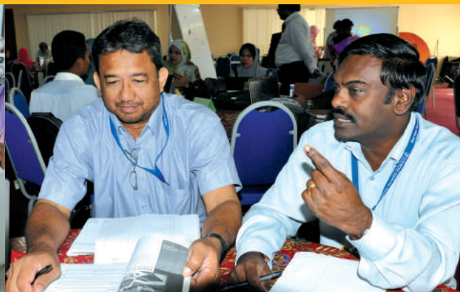
What's being discussed?