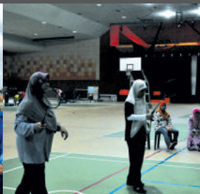
The fabulous duo