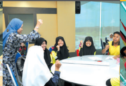
Go for it!