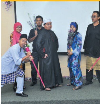
Strike a pose