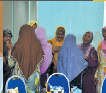
Peace, love and joy