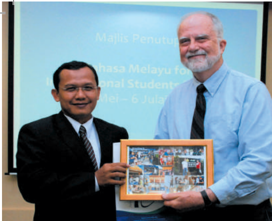
A moment of appreciation