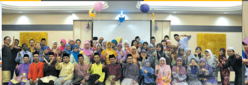
Cherish the moment