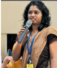
Break the ice