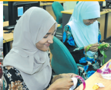
Creativity rhymes with festivity