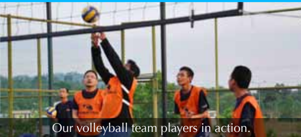
Our volleyball team players in action.