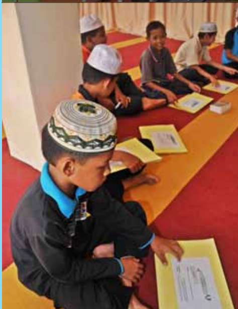
The kids were getting ready for the reading class.

22 May 2010. CMLHS extended its remarkable contribution to the society by organising a Let's Read (Jom Membaca) programme which had taken place at Permata Camar Orphanage (CAMAR), Sungai Soi, Kuantan.