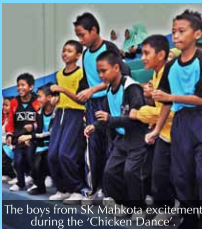
The boys from SK Mahkota excitement during the 'Chicken Dance'.

The events were part of community services planned for the centre's 2010 calendar and coordinated under CMLHS Community Service Unit to ensure the smoothness of the programmes. The programmes achieved its targets because everyone including the school teachers experienced a kindred spirit of fulfilment till the end of the programme.