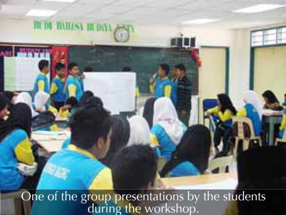
One of the group presentations by the students during the workshop.