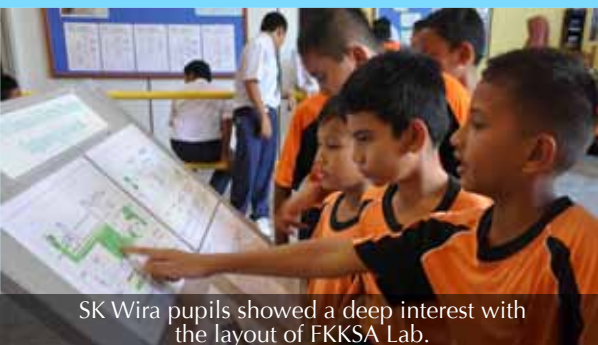
SK Wira pupils showed a deep interest with the layout of FKKS Lab.

Due to the huge crowd, both events had to be held at WDKU 1 at Block W, UMP, from 8.30 am to 2.00 pm.