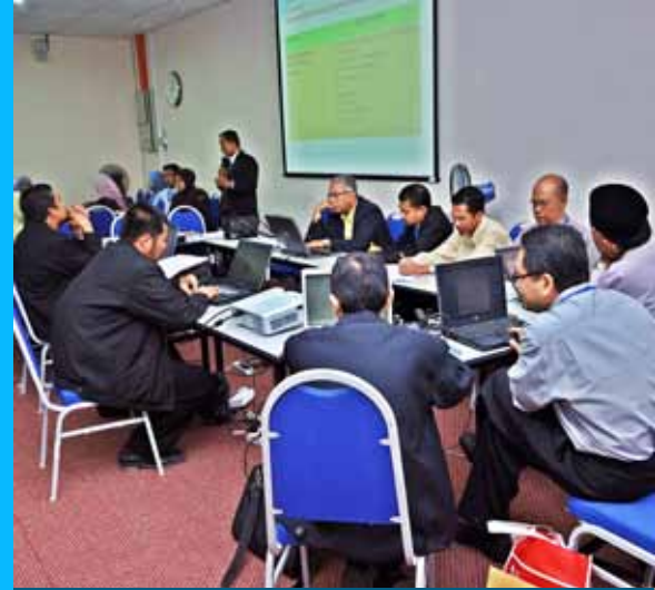
Our associates during CMLHS 2010 Existing Curriculum and New Programmes Workshop.

To date, the team is working on finalising the new teaching templates and also making arrangements to meet the proposed Board of Studies (BOS) which consists of academic experts and industrial expert panels. Upon acquiring BOS' consent, the next stage is UMP Senate Meeting which is to obtain an official endorsement to be brought forward to Ministry of Higher Education for the approval. The progress, despite the hard work and sleepless nights, hitherto has been encouraging. Hence, CMLHS associates hope that this good beginning will lead to a good ending (or better yet, another good new beginning)!