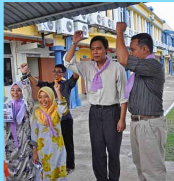
Ready! The bursary staff cheered enthusiastically upon completing a task.

Trainers watched with pride as the Prize-Giving and Closing Ceremony, the pinnacle event of the English Communication @ the Workplace Course, which took place at KPU Banquet Hall on 28 June, from 9.00 am to 11.00 am, has successfully revealed the confidence and hidden singing talents of the Bursary staff that was indeed, the goal of the course. The course was customised to the needs of the 50 staff (N41 and N27) from the Bursary Department where the classes took place twice a week, every Monday and Wednesday from 5.00 pm to 6.30 pm from 23 March to 14 June. The course was conducted by a group of eight trainers and facilitators from CMLHS.