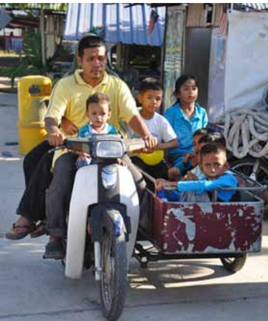
An every day view at the Tioman Island.