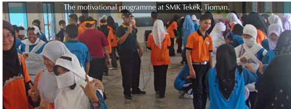
The motivational programme at SMK Tekek, Tioman.