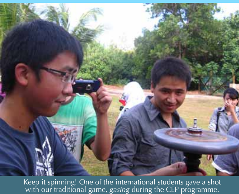
Keep it spinning! One of the international students gave a shot with our traditional game, gasing during the CEP programme.

21 June 2010. The Preparatory Intensive English (PIE) programme ended on June 18, 2010. The students had undergone twenty weeks of lectures as well as two Community Excursion Programmes. They sat for their final examinations from 14 till 17 of June 2010. Upon receiving their results, successful students embarked on their undergraduate studies. Registration for the new semester was on July 3, 2010.