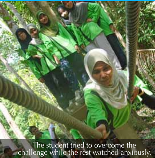
The student tried to overcome the challenge while the rest watched anxiously.

26 - 28 March 2010. What could possibly happen when groups of students went out for camping. A hullabaloo of aesthetic and energetic group of students, you can bet! This year, an enthralling and enjoyable camping event for Arabic and Japanese students, was held by the Department of Foreign Languages, Centre for Modern Languages & Human Sciences, UMP at Dusun Eco Resort, Bentong, Pahang.