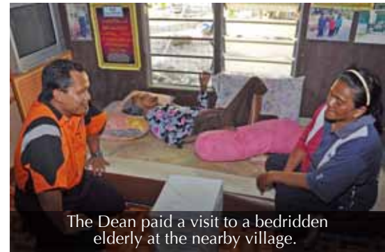
The Dean paid a visit to a bedridden elderly at the nearby village.

In line of 1Malaysia concept, the implementation of such activities can enrich the virtues of Malaysian youth as well as empowering their leadership qualities to equip them with the necessary skills to propel the country in the future. After all, they are the valuable apprentices that will continue the legacy of the nation.