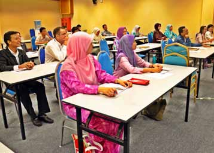
The participants during the T&L course.