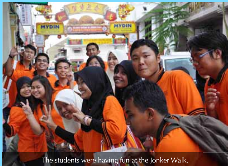
The students were having fun at the Jonker Walk.

26 - 28 March 2010. Nothing seems abnormal when using Mandarin at Jonker Walk, Malacca. That was a real life experience learnt by a group of 35 UMP students from UHF2011/2111 Intermediate Mandarin course who had participated in Mandarin Learning Camp 2010 held at Semabok Inn, Malacca.