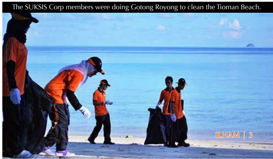
The SUKSiS Corp members were doing Gotong Royong to clean the Tioman Beach.