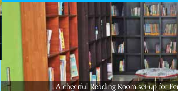
A cheerful Reading Room set up for Permata Camar Orphanage.